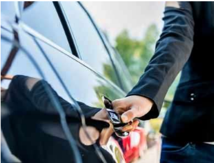
Airport transfer with private car

On the first day, our team will pick you up at the airport and assist you with preparations for the tour. A private coach will take you to your hotel in the city's heart.