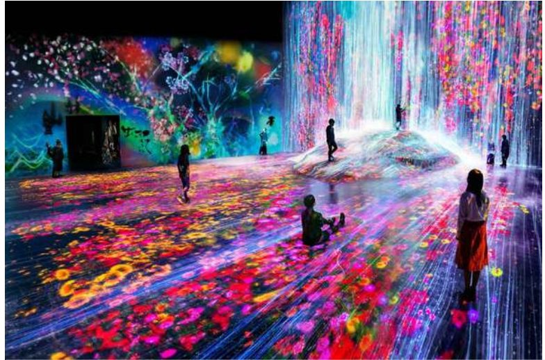
Teamlab Planet Tokyo

teamLab Planets Tokyo is a digital art museum that offers an immersive experience, blurring boundaries between art and viewer. Each room is a world of its own, filled with floor-to-ceiling projections that react to visitor movements. From floating through a universe of light to walking barefoot through mirrored pools, it's truly a sensory feast..