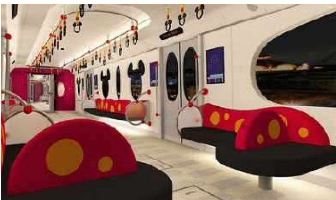
Disney Resort Train (inside)

After breakfast, your guide will pick you up from the hotel. Today you will go to Tokyo Disney Resort by railway. You can choose between Tokyo Disneyland or Tokyo Disneysea. From Maihama Station to Tokyo Disneyland, it's only five minutes on foot. To get to Tokyo DisneySea, hop aboard the Disney Resort Line and get off at Tokyo DisneySea Station.