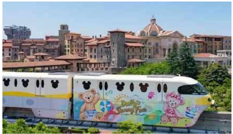
Disney Resort line

09:00 Pick up at the hotel 09:15 Transfer to Disney Resort 10:00 Free time at Disneyland/Sea 19:00 Transfer to hotel