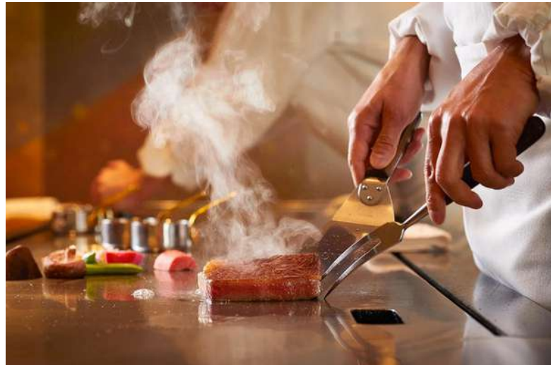
Wagyu beef course at one of the best teppanyaki restaurants in Tokyo

Before check-in at the hotel, you can enjoy wagyu steak lunch at one of the best teppanyaki restaurants in Tokyo.