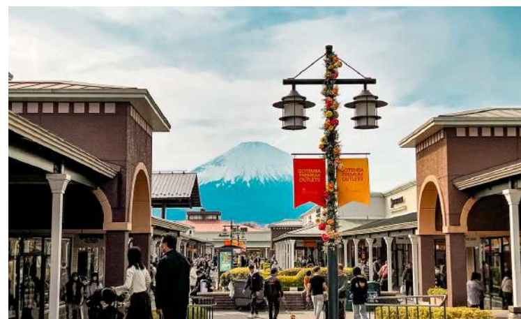
Gotemba Premium Outlet