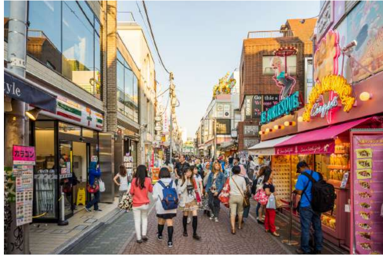
Takeshita Street (Harajuku)

Harajuku is one of the most extensive gathering points for Tokyo's diverse fashion tribes. Tightly packed shopping bazaar Takeshita-dōri is a beacon for teens all over Japan.